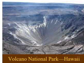
Volcano National Park—Hawaii